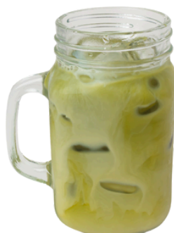
Thai Green Milk Tea