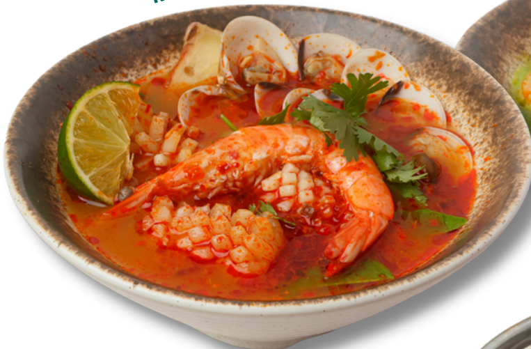
Red Tom Yum Soup