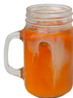
Thai Milk Tea