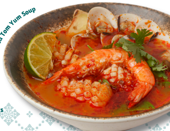
Red Tom Yum Soup

All prices are subject to 10% service charges and 9% GST Lunch specials cannot be combined with other promotions, discounts, or vouchers *Excludes eve of public holidays and public holidays Images are for reference purposes only