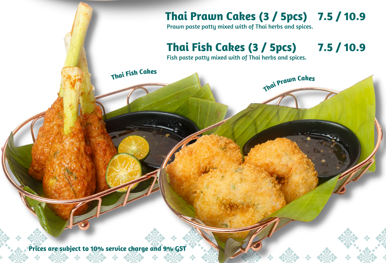
Thai Prawn Cakes

Prices are subject to 10% service charge and 9% GST