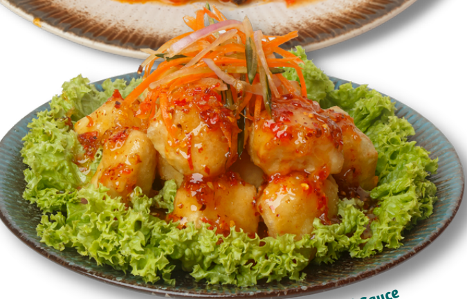
Deep-Fried Tofu w Sweet Thai Chilli Sauce