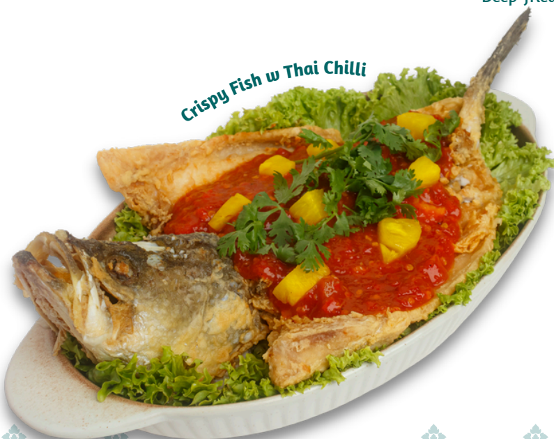
Crispy Fish w Thai Chilli

Deep-fried seabass, drizzled with tangy sweet & sour sauce.