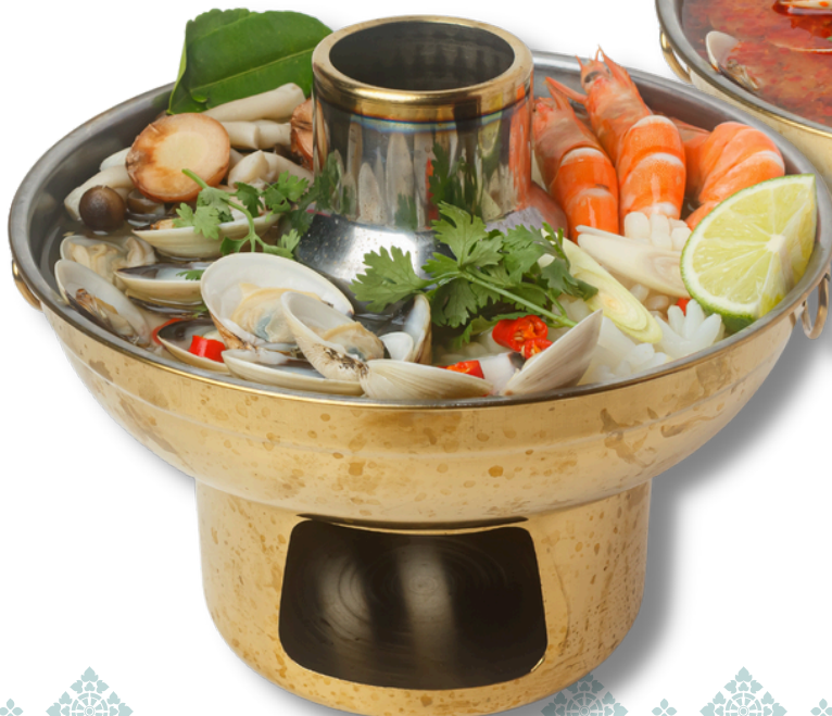
Clear Tom Yum Soup (Large)