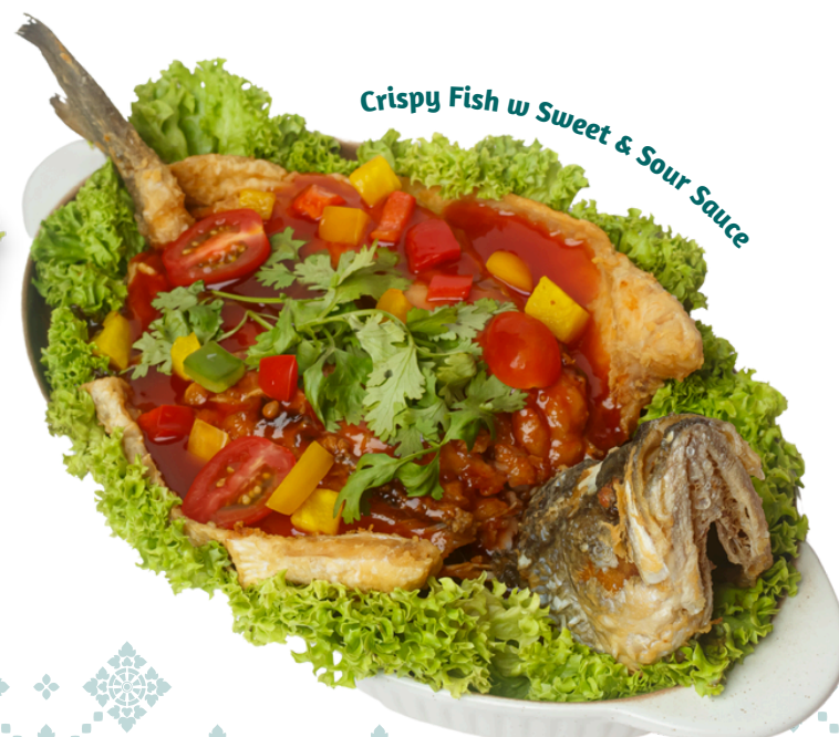
Crispy Fish w Sweet & Sour Sauce

Prices are subject to 10% service charge and 9% GST