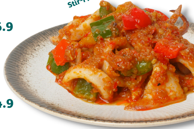
Stir-Fried Squid w Sambal