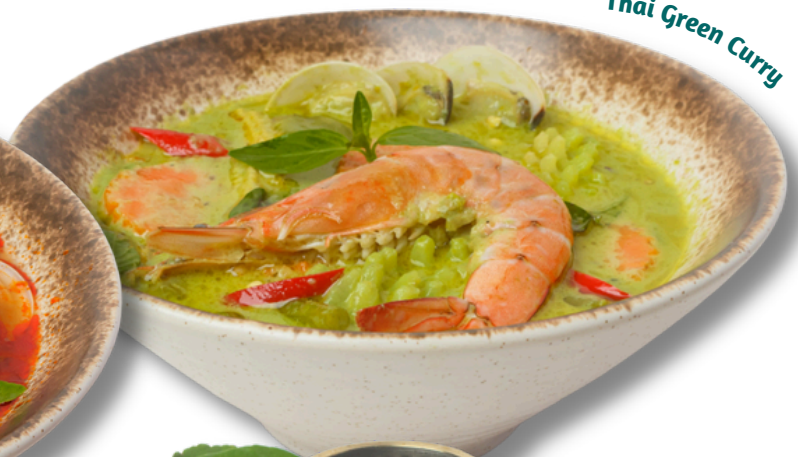
Thai Green Curry