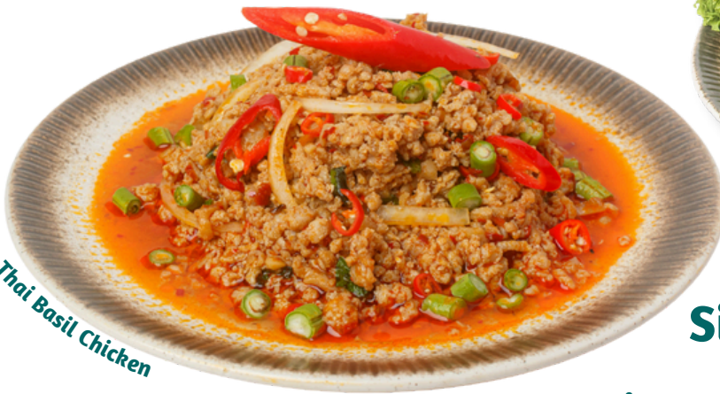
Thai Basil Chicken