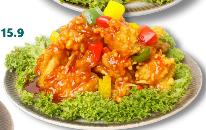
Sweet & Sour Fried Chicken