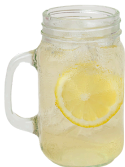
Ginger Lemon Tea