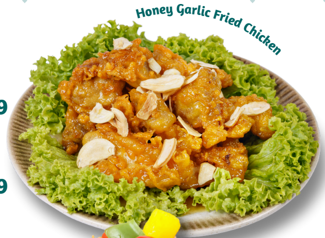
Honey Garlic Fried Chicken

Stir-fried minced chicken with Thai basil, long bean, onion and chilli.